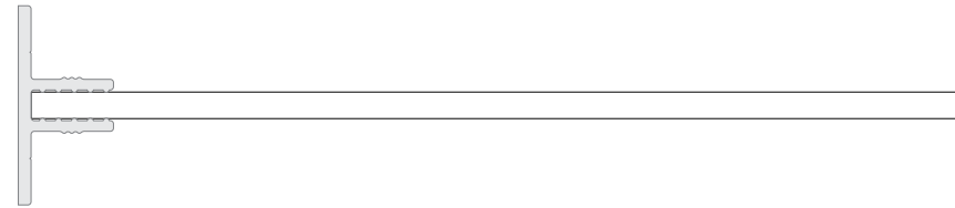
FRONT VIEW - SIDE A